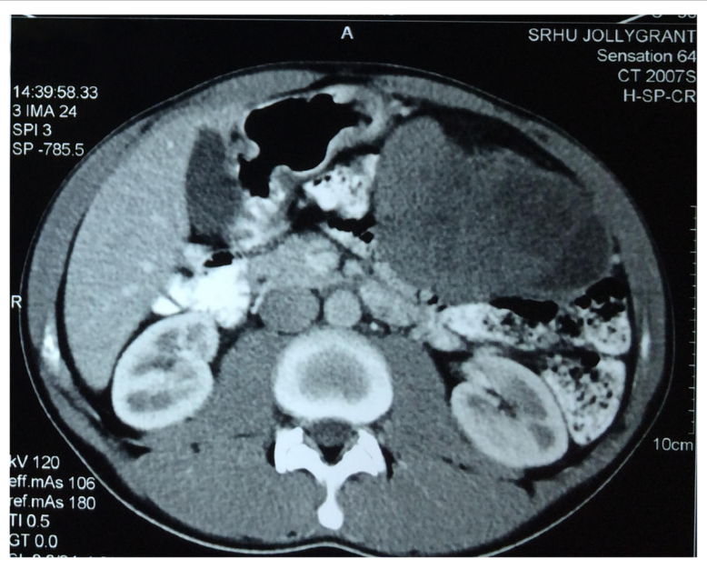
Fig. 1 Showing a large well defined mass of 9.8 × 7.4 cms along with displacement of the bowel loops

tumor with metastasis in regional lymph nodes and perinodal extension. Lymph nodes were free of tumor, and there was only reactive hyperplasia. On cross section examination, cut surface was homogenous grayish white along with many areas of hemorrhage and necrosis. On microscopy, tumor cells have round to mildly pleomorphic nuclei, with coarse chromatin and indistinct cell borders. Large areas of tumor necrosis are seen (Fig. 3).