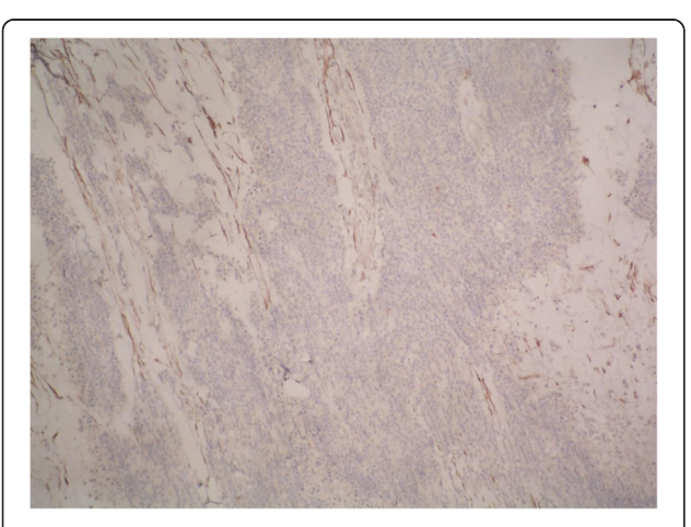
Fig. 5 Immunohistochemistry 10 \times 10 \times shows tumor cells are negative for pancytokeratin

Intraperitoneal RMS, and in particular with omental involvement, in any age has been rarely reported in literature [2]. In general, the symptoms of omental