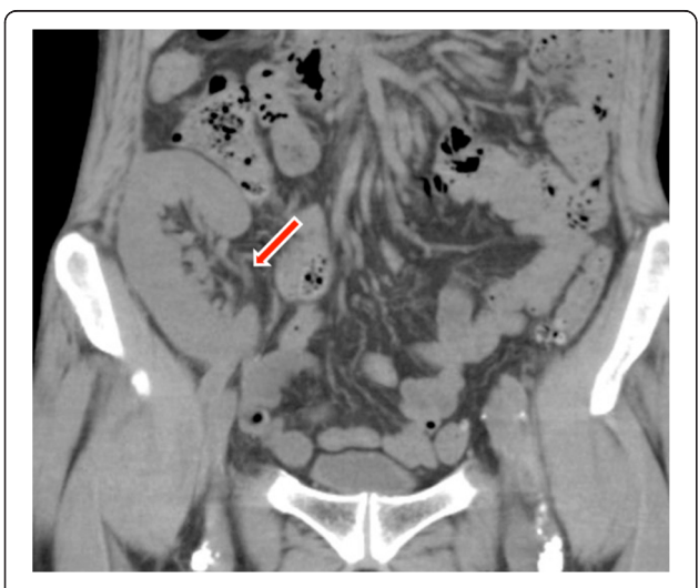
Fig. 2 Non-enhanced abdominal CT scan (coronal) shows that the location of the transplanted ureter is unclear ( arrow )

Hernia occurred on the kidney transplant side in our patient and additionally, a vascular prosthesis had passed through under the skin on the ventral side of the inguinal canal. A skin incision was made on the caudal side in parallel to the vascular prosthesis, and the surgical field was maintained by pulling the tissue with attached subcutaneous fat to avoid exposure of and damage to the vascular prosthesis. Mild adhesion of the inguinal canal around the spermatic cord was noted and may have been due to the surgery performed for kidney transplantation, but dissection was relatively easy. The