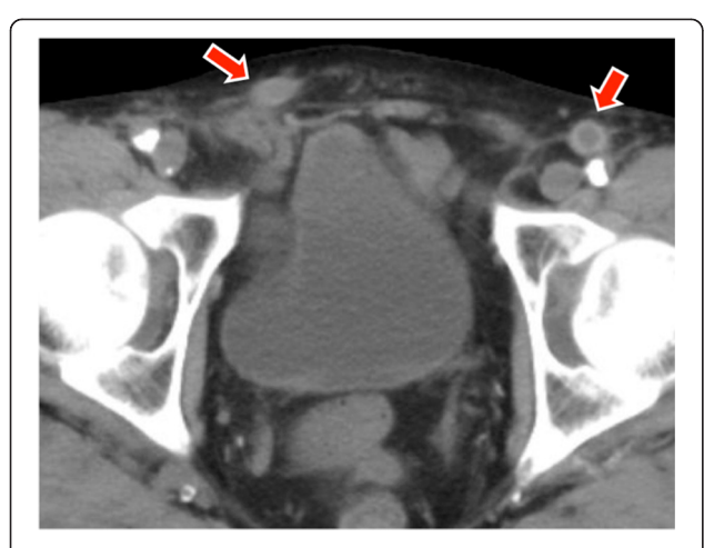
Fig. 1 Non-enhanced abdominal CT scan (axial) showing the vascular prosthesis bilaterally ( arrow ), one on the right side positioned ventrally in the right inguinal canal

placed in the right ureter was not palpated during surgery. The postoperative course was uneventful, and the patient was discharged 4 days after surgery. No recurrence of hernia or complication has subsequently occurred.